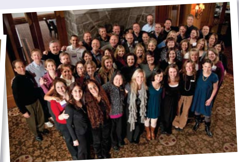
CCA Board of Directors, Ambassador Board and staff at the annual Board and Staff Retreat.