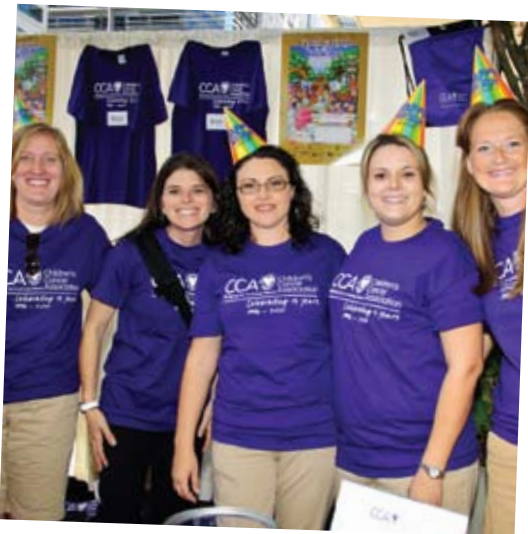
Volunteers celebrating CCA's 15th birthday at the annual Celebration of Courage Family Festival downtown Portland.

This year alone, 1,300 community members have dedicated their time to volunteer with the Children's Cancer Association. It's a great way to get involved and give back to local families suffering from pediatric illnesses. Whether your interests are in supporting CCA events, being a Chemo Pal mentor, internships or office support, CCA has a place for you! For more information on volunteering with CCA, please contact Volunteer@JoyRx.org or 503-244-3141.