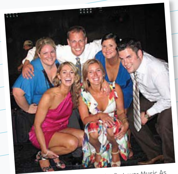
The planning committee for the first ever Music As Medicine event. The event to benefit CCA raised more than $30,000.

Join Genentech in the "Block Out Cancer" Campaign as they donate $25 from each Blazer's blocked shot at home games during the 2010-2011 season. Get involved and help local families and children by visiting www.joyrx.org/blockshot