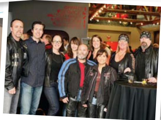
CCA's 2010 JoyRide kick-off party at MotoCorsa.