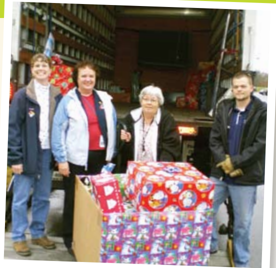
Intel employees and Direct Transport gathered to load a truck full of wrapped gifts for sponsored Holiday Families.

For more information, contact Bev Tollefson at btollefson@JoyRx.org or call 503-200-5109.